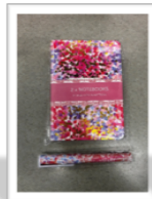
Notebook and Pen