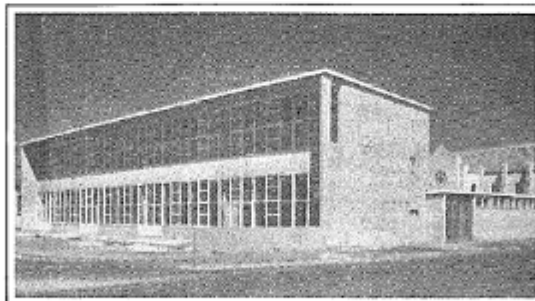
Facing Woodbine Grove