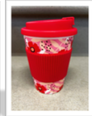
Eco Travel Mug