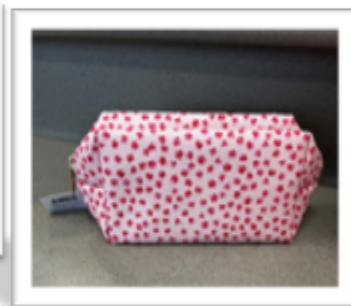
Make up/Jewellery Bag