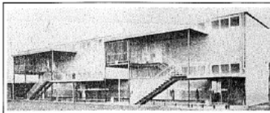
Facing school yard