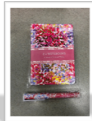
Notebook and Pen