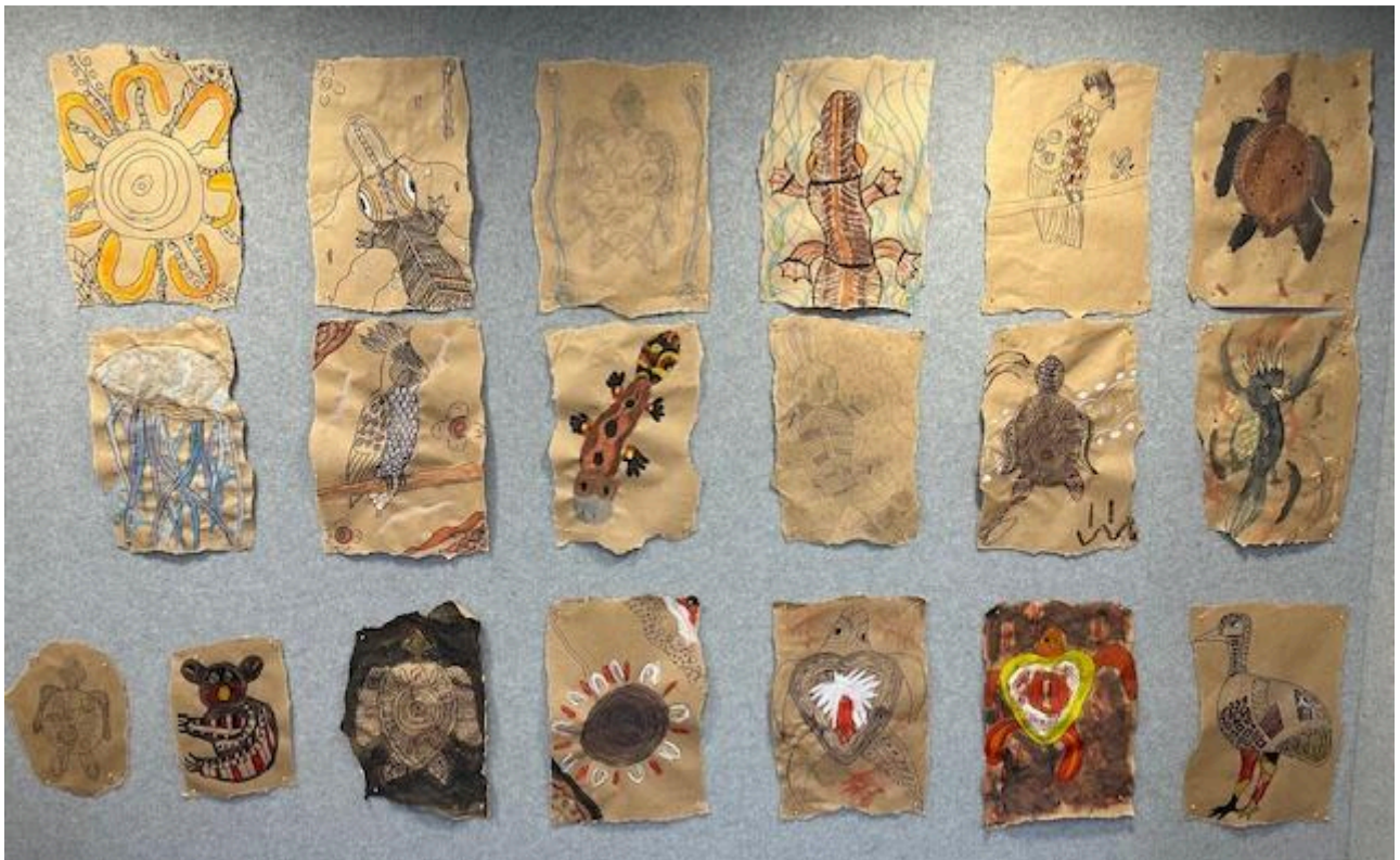
Yr 5/6 Indigenous Artwork

Term 1, Week 3 Thursday 15th February 2024